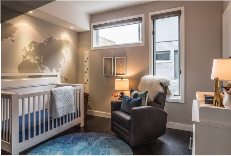
SECOND BEDROOM: Large window with custom blinds | Two closets with built in organizers | Floating shelves

SECOND FLOOR: 616 square feet with 9 ft ceilings, hardwood flooring, crown moulding & halogen pot lights throughout