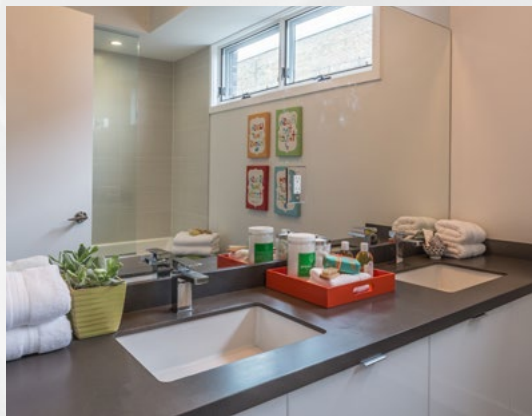
5 PIECE BATHROOM: Services 2nd and 3rd bedrooms | Double sink vanity with Caesarstone countertop and wall-to-wall mirror | Glass enclosed shower/tub combination