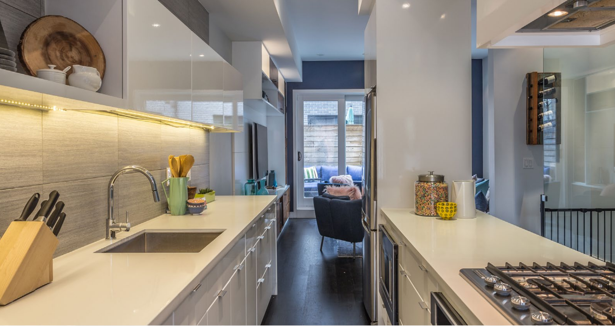
KITCHEN: Large windows throughout main floor provide abundant natural light | Magnificent "FLOATING STAIRCASE" is focal point of this contemporary space | Centre island with Caesarstone counters | Custom white lacquer cabinetry with custom backsplash | Built in floating shelving | Stainless steel KitchenAid 5-burner gas stove & exhaust fan | Stainless steel Samsung refrigerator & freezer | Built in Blomberg integrated dishwasher | Built in KitchenAid microwave | Stainless steel KitchenAid oven