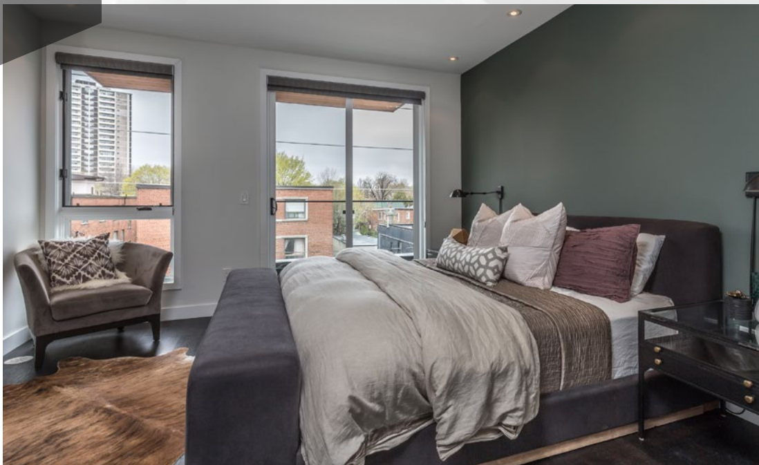
MASTER BEDROOM: Private suite with pocket door for privacy | Picture window and custom blinds | Oversize walk-in closet with built-in organizers | Balcony

THIRD FLOOR: 558 square feet with 9 ft ceilings, skylight, hardwood flooring, halogen pot lights & crown moulding