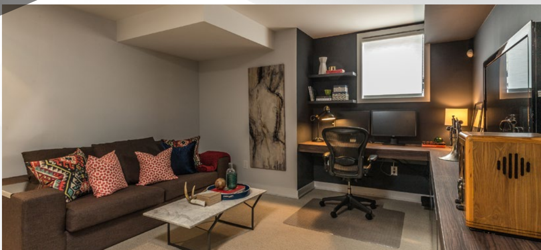
RECREATION ROOM: Custom built in cabinetry | Broadloom | Closet, storage and utilities room

LOWER LEVEL: 338 sf with an above grade window, broadloom and direct garage access