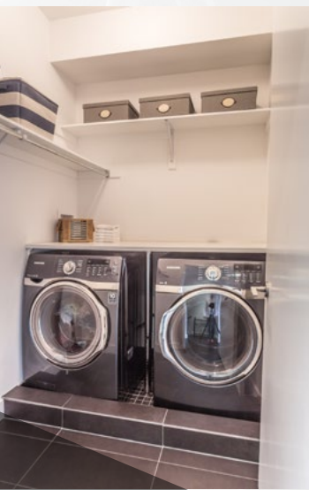
LAUNDRY ROOM: Oversized with Samsung washer and dryer