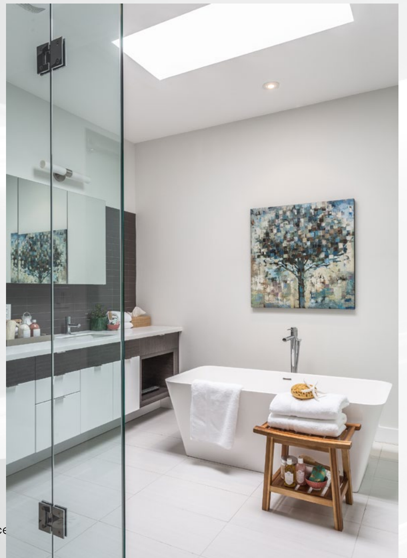
5-PIECE ENSUITE WASHROOM: Oversize glass enclosed shower with rain shower head | Contemporary freestanding soaker tub | Large custom vanity with 2 sinks, Caesarstone countertop and medicine cabinet mirrors | Skylight | Private water closet

LOWER LEVEL: 338 sf with an above grade window, broadloom and direct garage access