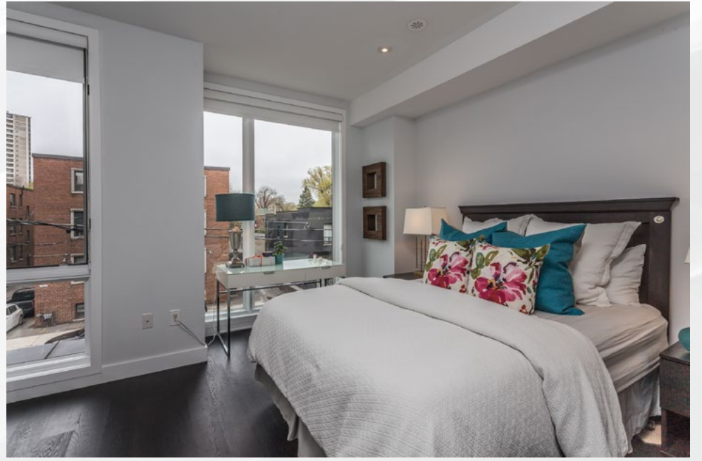
THIRD BEDROOM: Large window with custom blinds | Double closet with built in organizers