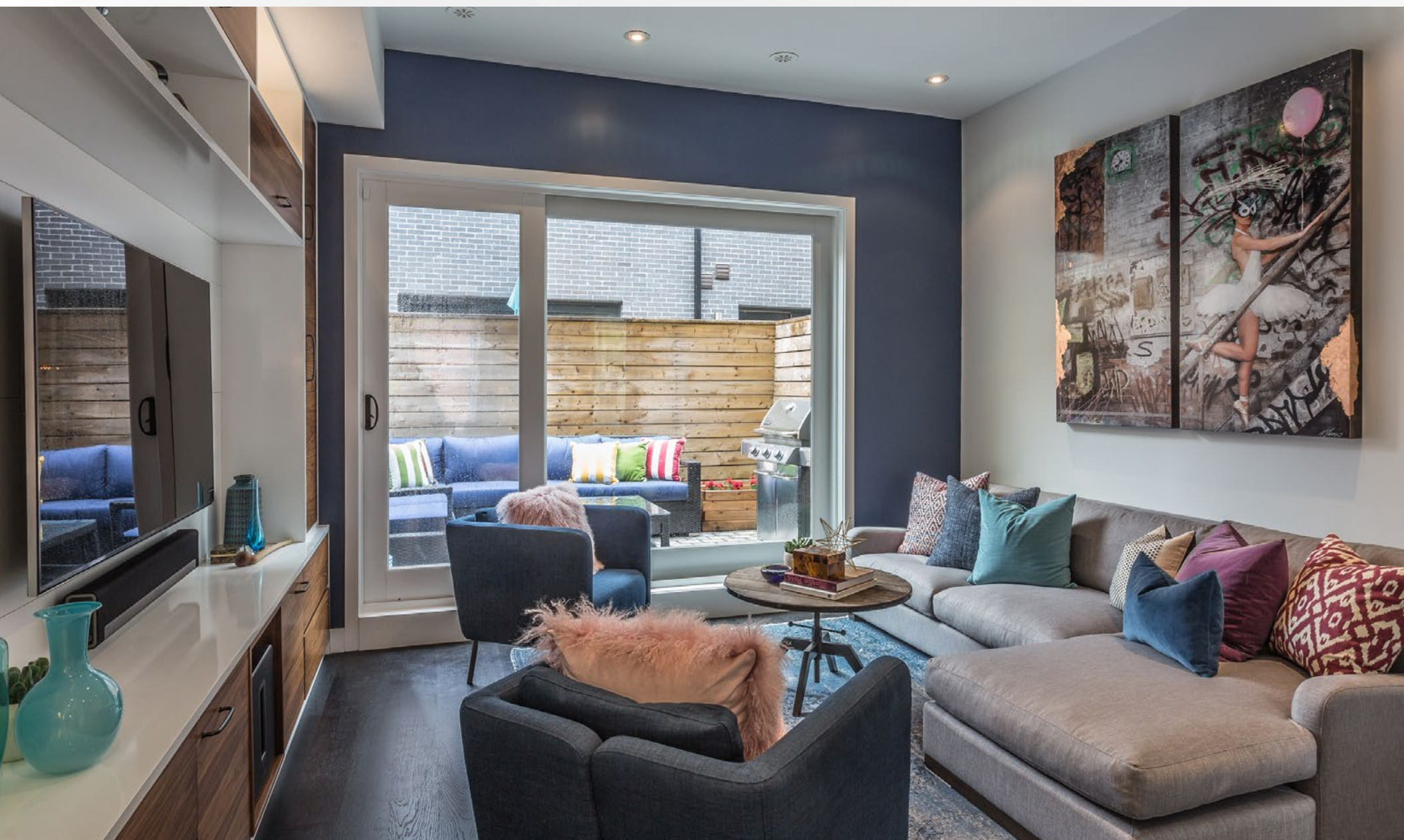
POWDER ROOM: 2 piece powder room | Tile floor